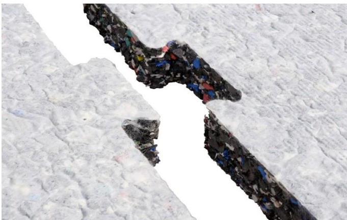
Puzzle shaped Puzzlepads for Playgrounds fall protection pad