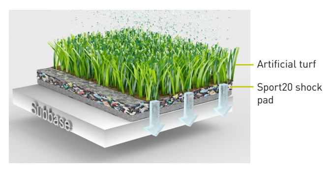
Artificial turf system with Sport20 shock pad