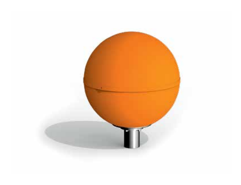
Diagram 1: Overall view of the play equipment